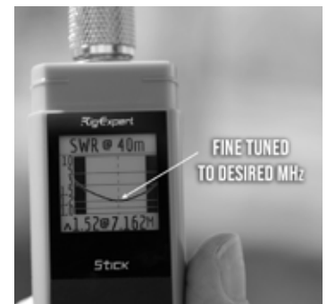
FIG. 4 - After turning the tuning collar the appropriate direction, the resonant point directly aligns with the desired frequency.