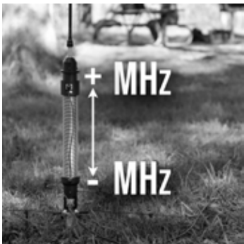
FIG. 1 - Lowering the tuning collar results in a lower MHz resonant point, raising it increases the MHz.