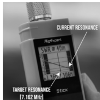
FIG. 2 - Since the target resonance is lower than the current resonance, the tuning collar must be moved down.